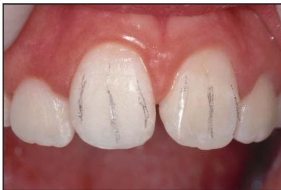
Figure 11. Lines were drawn on the teeth to define the line angles and to create dentinal lobes.