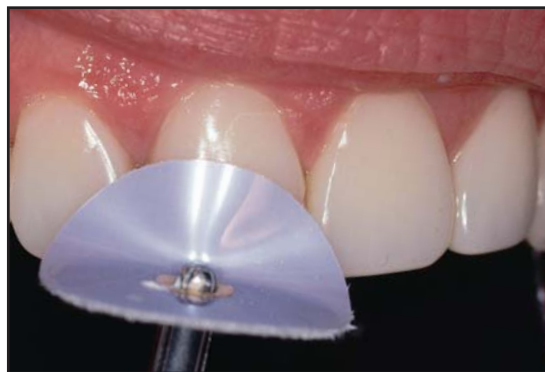
Figure 8. A super-fine gloss finish can be achieved with a buff wheel and polishing paste.

The height of contours that should be placed on the bonded tooth should be drawn, in pencil, prior to finishing. Thin flexible disks can then be used on the