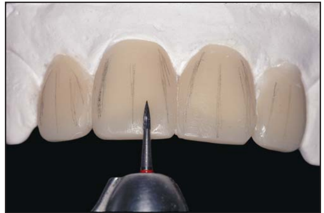
Figure 2. Appearance of the composite mock-up placed on a stone model to provide instruction on composite contouring.