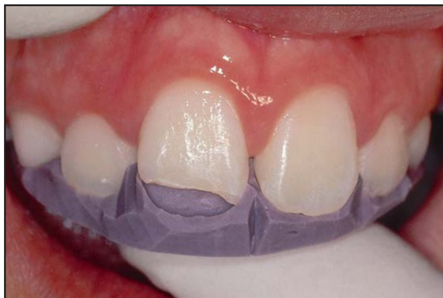
Figure 4. The putty matrix was used to establish the incisal and lingual contours.