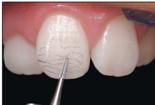
Figure 9. A tapered, round-end carbide bur was used to create the perikimata.