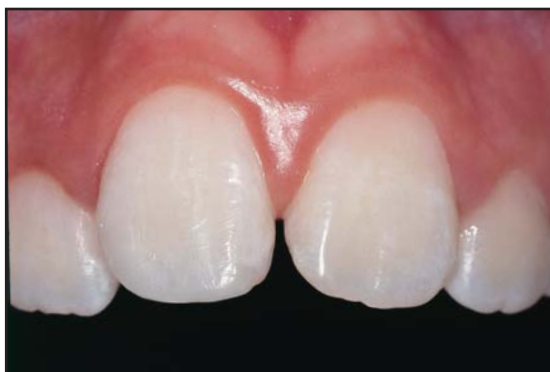
Figure 12. Postoperative appearance of the restoration. With the correct finishing and polishing techniques, a mirror image of the adjacent natural tooth was created.