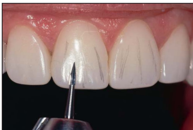
Figure 6. Creation of the secondary anatomy can be performed with a small flame-tip carbide bur.

to achieve the proper finish and polish by creating appropriate primary, secondary, and tertiary anatomy on a composite restoration.