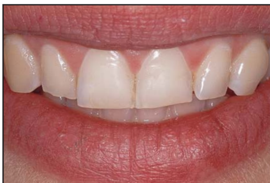
Figure 13. Preoperative view of the severely worn incisal edges and dark teeth.

preserve the heights of contour. 7 By observing the incisal edge, the clinician can determine if the desired lobe formation is achieved (Figure 7). If the tooth requires additional surface texture, a fine diamond bur can be used at a low speed from the mesial aspect to the distal. A medium rubber cup, a fine rubber cup, and a felt buff wheel can be used with a polishing paste