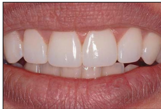
Figure 14. A buff wheel and polishing paste were used to achieve a super-fine gloss finish.

preserve the heights of contour. 7 By observing the incisal edge, the clinician can determine if the desired lobe formation is achieved (Figure 7). If the tooth requires additional surface texture, a fine diamond bur can be used at a low speed from the mesial aspect to the distal. A medium rubber cup, a fine rubber cup, and a felt buff wheel can be used with a polishing paste