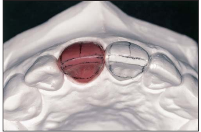
Figure 1. Preoperative waxup following creation of the incisal edge and interproximal embrasures.

Line angles are clearly defined by the light reflective surface. If wide or narrow line angles are present, the tooth will appear overly large or small. In certain instances where the tooth space is not ideal, use of various line angles can allow the clinician to create an illusion of appropriate size in a nonideal area. 1 A tooth waxup exercise can be used to practice the replacement of missing tooth structures with the proper anatomy (Figure 1). In this exercise, the incisal edge is created first, followed by the mesial and distal line angles that simulate the light reflective surfaces. The line angles form a shell, within which the tooth is formed. This will help the dentist understand the primary and secondary anatomy using a simple and practical restorative material. Composite mock-ups can then be used to instruct clinicians on how to accurately contour composites (Figure 2). The composite mock-up exercise can be performed on a typodont or on extracted teeth. 2 “Hands-on” direct composite resin workshops where these techniques can be practiced and critiqued are highly recommended. This article will discuss the protocol used