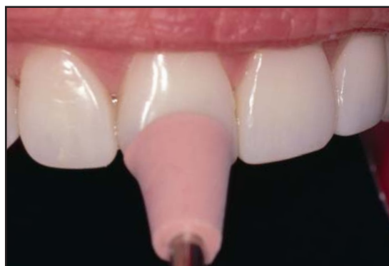
Figure 10. A high polish was achieved using rubber cups and points.

mesial line angles, followed by contouring of the distal line angles 6 . Flame-tip carbide burs (eg, #7901, Brasseler USA, Savannah, GA; H 246-009, Axis Dental, Irving, TX) can be used to create the facial lobes and depression areas. It is, however, critical to create a depression area rather than a sharp line by carefully passing the flame-tip carbide bur back and forth to