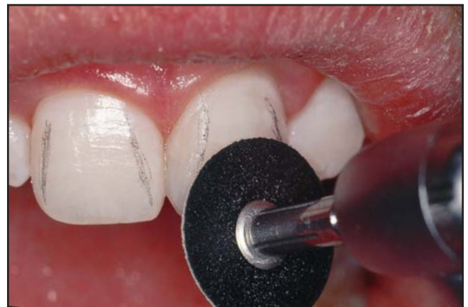
Figure 3. A coarse finishing disk was used to establish the restoration's primary anatomy.