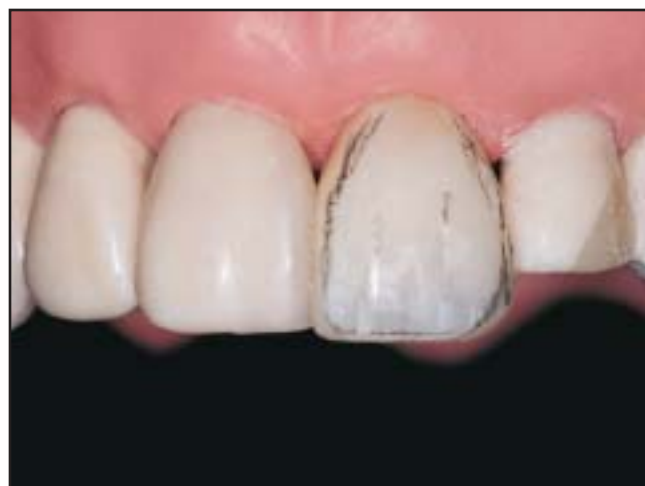
Figure 13. The line angles and heights of contour can be drawn in pencil to match those of the adjacent tooth.

A football-shaped carbide bur should first be used to contour the lingual aspect (Figure 11). A coarse finishing