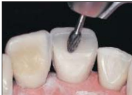
Figure 11. The lingual excess is trimmed with a high-speed football-shaped diamond bur.