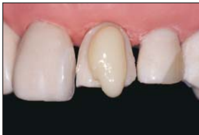
Figure 4. A cylinder of hybrid composite is placed over the facial surface following placement of the adhesive agent.