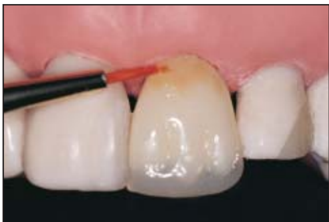
Figure 6. A brown or yellow tint is added to the cervical area to provide a more natural appearance. A translucent hybrid should also be added to the incisal region.

edges, and opaque hybrid composites have the ability to mask darkness in the underlying tooth structure. This opaque material effectively restores the dentin layer of the tooth. If the enamel layer is the only aspect that requires restoration, however, the hybrid layer may not be necessary. If no color change is required and the incisal edge remains intact, a microfill can be used alone with predictable and aesthetic results.