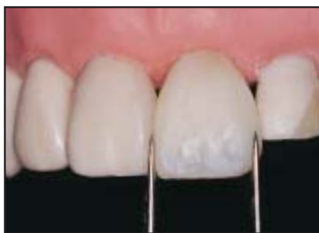
Figure 12. The width of the veneer on tooth #9 should be compared to the width of tooth #8 using dividers or calipers.

to the tooth and evenly distributed (Figure 4). Care must be taken not to overcontour the interproximal areas. This hybrid layer is applied using a composite instrument, and dentinal lobes are established (Figure 5). The mamelon anatomy (incisal aspect of dentinal lobes) can be enhanced through the placement of ochre tint on tips of the lobes. The violet tint can be added to the lobe concavities and interproximal region to provide a more translucent effect prior to polymerization.