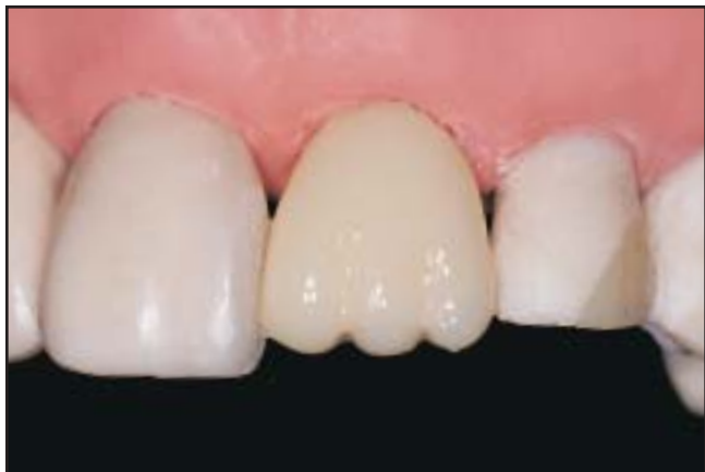
Figure 5. The hybrid composite is evenly placed over the entire facial surface. Incisal dentinal lobes are established and facial surface is contoured.