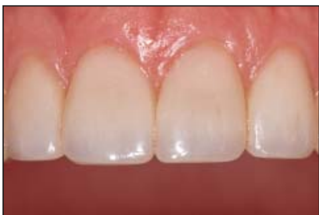
Figure 19. Postoperative facial view demonstrates the aesthetic integration of the definitive restorations.

there is a dark stained area, an opaquer is used to conceal the darker area until it matches the rest of the tooth. Once the subsequent restoration is finished and polished, the other teeth can be restored (Figure 15). Hybrid, microfill, tint, and incisal composites are placed so the layers would overlap to enable refined blending and gradation of colors and materials.