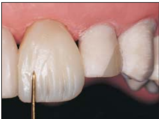
Figure 8. The incisal region should subsequently be intersculpted to characterize the tooth and provide a more natural effect.

For the purpose of this exercise, no attempt has been made to match the shade of the adjacent teeth in the typodont. A deep facial reduction (0.75 mm to 1 mm) should be performed to simulate deficient clinical teeth and enable subsequent restoration with the hybrid and microfill composite layering technique. The incisal edge can also be reduced by 1.5 mm to simulate a deficient incisal aspect and demonstrate the creation of proper translucency.