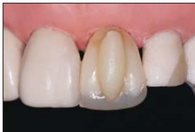
Figure 7. A cylinder of microfill composite is added to the facial surface. The placement of excess composite limits the creation of voids and pits in deficient areas.

Tints and opaquers are used for intrinsic staining and characterization of the composite restoration (ie, Creative Color, Cosmedent, Chicago, IL; Kolor + Plus, Kerr/Sybron, Orange, CA; Tetric Color, Ivoclar Vivadent, Amherst, NY). Opaquers are highly pigmented, light-cured liquids that can be used to conceal dark tooth structure, translucency, and metal, and to change color. Incisal translucency is simulated using violet, gray, and blue tints. Slight gingival shade change can be accomplished with brown, orange, or honey-yellow tints. The use of tints and opaquers should be subtle, and these materials must always be overlaid with a microfill or hybrid resins. A complete composite restorative system