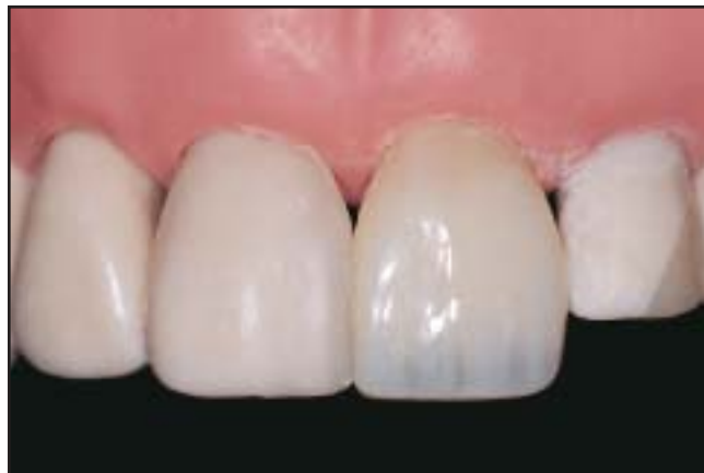
Figure 14. Facial view of the direct resin veneer after finishing and polishing.

Once this restoration is completed, the same process would be followed for the adjacent tooth. Note that if