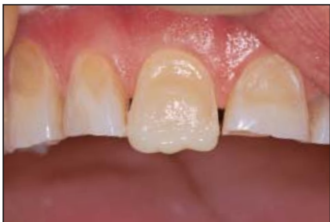
Figure 17. Once tooth #8 was etched and bonded, a hybrid composite was added to the facial aspect.