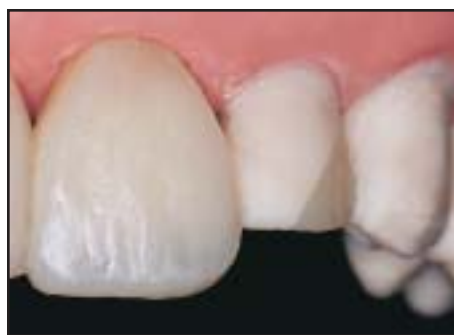
Figure 10. The final contour of tooth #9 is demonstrated prior to finishing.

Full veneer preparations are performed on teeth #9(12) through #11(23) to provide adequate space for the use of a hybrid (opaque dentin) and microfill (enamel/translucent) layer (Figure 2). For the purpose of the typodont exercise, a full 1-mm reduction was performed at the facial aspect, and 1.5 mm was removed from the incisal edge. The preparation should extend halfway into the contact area (Figure 3). While all veneer preparations do not require incisal reduction or as deep a facial reduction, this example is used to simulate a more complex situation and demonstrate the incisal effects of composite materials.