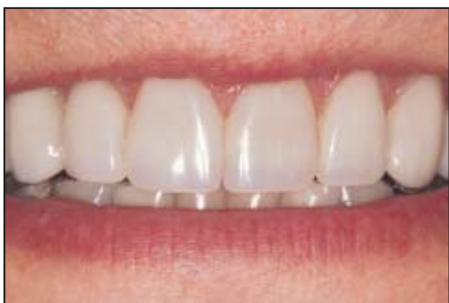
Figure 18. Upon completion of direct resin veneers for the six anterior dentition, teeth #4, #5, #12, and #13 were subsequently restored to fill the dark buccal corridors.