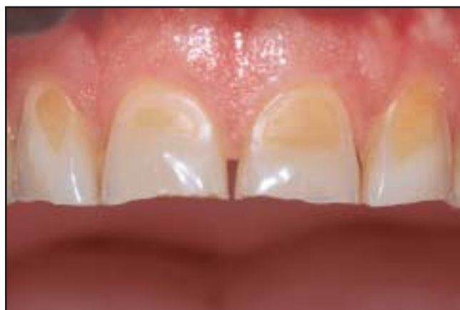
Figure 16. Preoperative facial view demonstrates the presence of extensive abrasion, erosion, and worn incisal edges.