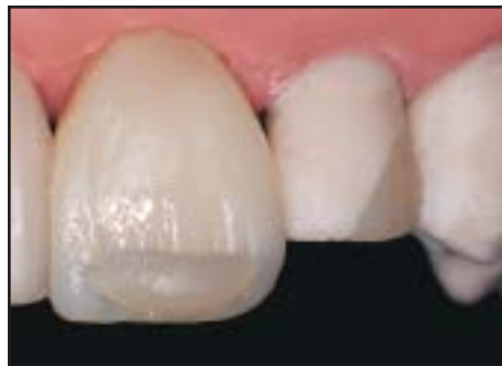
Figure 9. It is necessary to “wet” the incisal area with unfilled resin or flowable incisal microfill during placement of the translucent incisal microfill composite.