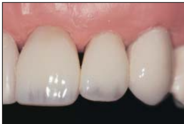
Figure 15. Postoperative view of the direct resin veneer restorations placed on the typodont model.