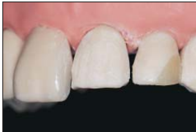
Figure 3. A model is used to illustrate the preparation of typodont teeth #9, #10, and #11 for subsequent placement of direct resin veneers.

In extensive restorations, the hybrid composite is the first layer that contacts the natural tooth structure (ie, Renew, Bisco, Schaumburg, IL; Charisma, Hereaus Kulzer, Armonk, NY; Filtek Z250, 3M ESPE, St. Paul, MN). This material is highly filled with ground particles (ie, quartz, strontium, heavy metal glasses that contain barium). 10 This is the material of choice for posterior restorations, and it provides an excellent underlying layer when a microfill is used as the surface layer on anterior restorations. 11 Hybrid composite materials can be successfully used for the restoration of Class IV anterior restorations and any restoration where a high amount of stress is anticipated. 12 The radiopacity of hybrid materials is particularly important during the placement of Class II posterior